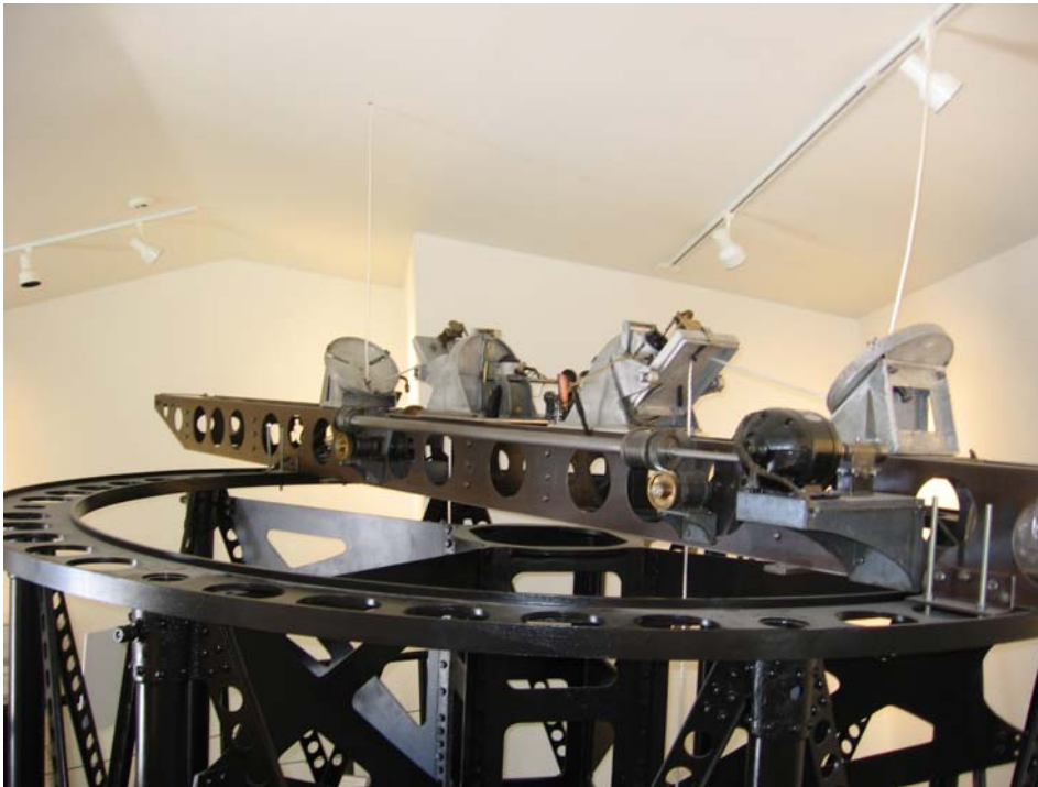
Figure 1: The 20 ft beam as seen in the Mt. Wilson Interferometer Museum.

instrument. In 1899-1900 Vogel turned the power of the newer and larger Potsdam double telescope on Mizar; publishing his findings in 1901. Employing a slit type prism spectrograph, Vogel found substantially the same differential radial velocity value as Pickering, however, he determined the interval to be ~10.25 days leading to the modern value of 20.5386 days for the orbital period or about one fifth of Pickering's. In 1925 Francis Pease resolved the pair using the 20-foot beam interferometer attached to the 100-inch at Mt. Wilson (see Figure 1) and determined their separation to be 0.01 arcsecond. The pair is now designated PEA 1 Aa in the WDS Catalog. This was an early example of a spectroscopic pair measured by visual methods, the first being Capella measured by Anderson in 1919 with an earlier interferometer