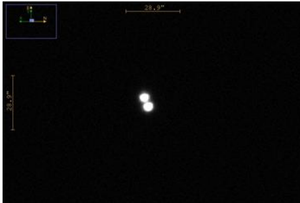
Figure 1: The double star WDS 01335-0331 HJ 640 taken with an exposure time of 10 seconds. This image was taken on the Haleakala Observatory in Hawaii on the island of Maui.