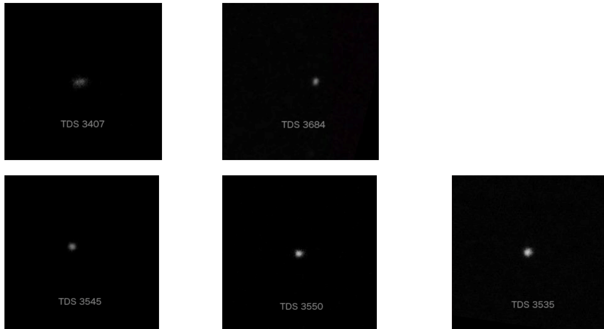
Figure 1. McPhee's images for some of the measured objects