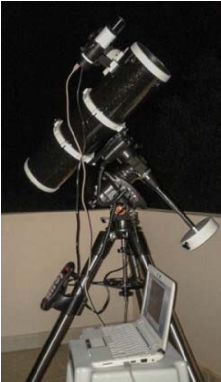
Figure 3. The Equipment